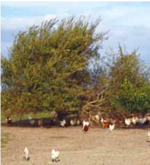
Even just one established tree offers a huge amount of shade and shelter close to the shed

Trees close to housing units capture part of the atmospheric emissions of ammonia and reduce the impact on the surrounding environment.