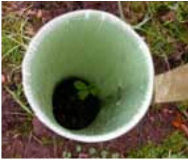
The young sapling will be protected from the birds with a plastic tube