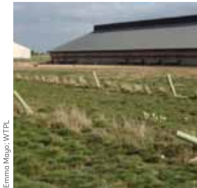
Emma Mayo: WTPL

If the trees are planted and weeded well there shouldn't be much other early maintenance to do.