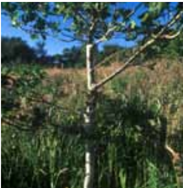
If a tree is not weeded the grass will compete and slow down the growth rate of the tree

Watering is not normally necessary provided the trees have effective weed control. However if the infrastructure is in place and water can be easily and cheaply applied, then it may be worth considering in periods of severe drought, particularly during the early part of the growing season following planting.