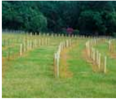
Space the trees in a way that will suit your future management