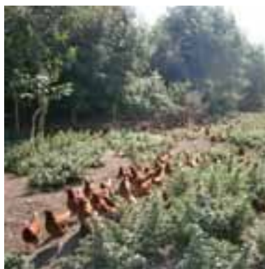
This woodland is due to be thinned as the canopy has closed and it is very dark inside. Creating areas of light will allow the ground flora to return and the hens should roam further into the woodland area