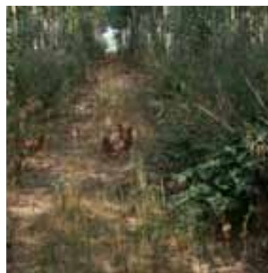
This woodland is ready for thinning as the canopy has closed. The dappled shade and thick undergrowth around the trees has tempted hens to range up to 50m from the shed