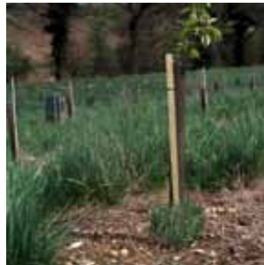
A tree weeded in a 'polo mint' shape is less susceptible to pecking around the roots