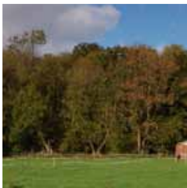
Dense woodland canopy – without thinning and management your woodland could become too dense and dark

If you do make bonfires ensure these are completely extinguished before allowing the birds to roam again.