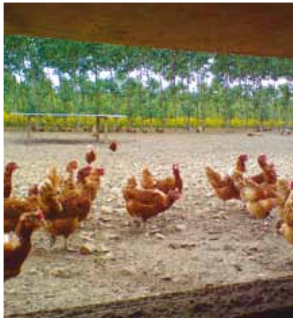
Trees provide an attractive view from the pop-holes and encourage birds outside by providing foraging under natural shelter, away from wind and predation