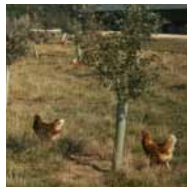
Within a few years, the young trees will start to provide shade and shelter