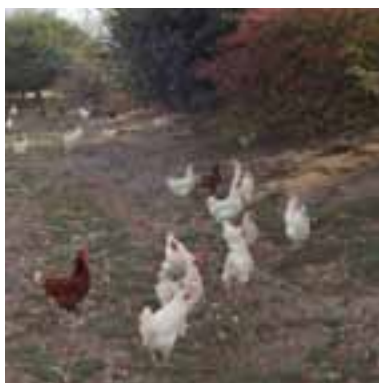
The hens will make good use of the shade cast by more mature trees