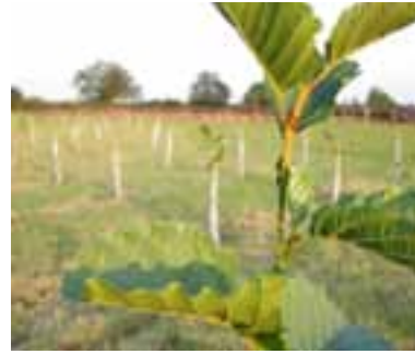
Well planted trees will soon start to pop out of the tubes